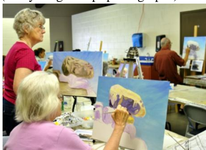
You may see these paintings in the "Same – But Different" show along with other painting created during a class with Chuck Caplinger.

January 2012 – Artists on Display (everything except photographs)