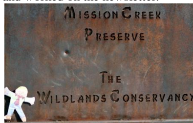
Flat Stanley at Mission Creek Preserve.