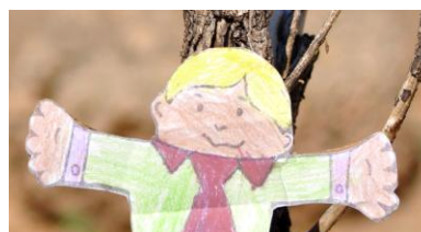
Flat Stanley at Barker Dam

We didn't spot any big horn sheep on this trip but we enjoyed ourselves.