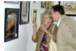
of this show was fall you can see everything from falling down fences, New England in the fall, fall in the desert, Oktoberfest in Germany, and other colorful sights.

If you like fall then this is the show for you. Artwork by nineteen members of Chaparral Artists is currently on display at A Roadside Attraction Gallery until December 14. Since the theme