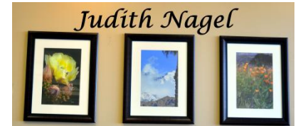
Currently on display in the main lobby of the Hi-Desert Medical Center