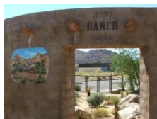
One of walls at the Water Wise Demonstration Garden