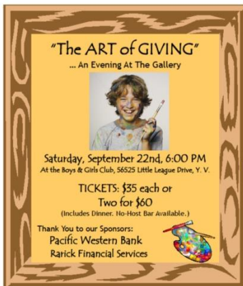
For Tickets or Sponsorship Information, call 760-365-5437

The Boys & Girls Club of the Hi-Desert Presents their annual Live & Silent Auction Fundraiser ...