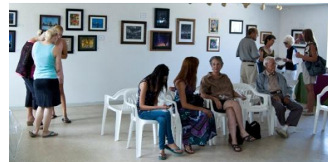
Some visitors & artists enjoying the show at Roadside Attraction Galley