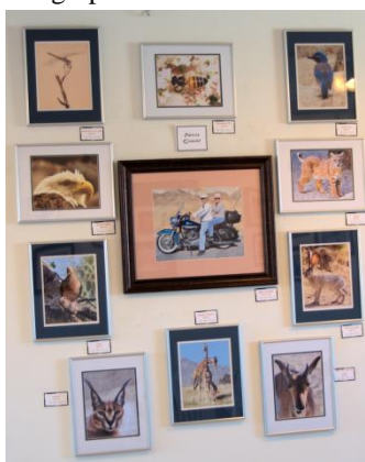
at last year's Creatures Big & Small

You can turn in your artwork either at our meeting on Monday, Sept. 10, on Thursday, Sept. 13, from 4:00 – 6:00 p.m. or Friday, Sept. 14, from 10:00 a.m. – Noon.