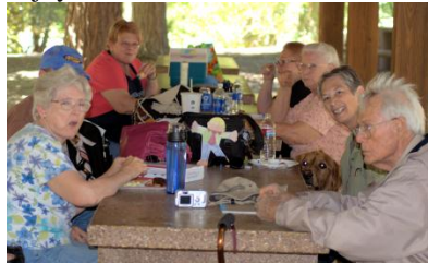
A few of those who attended the Paint Out at Whitewater Preserve