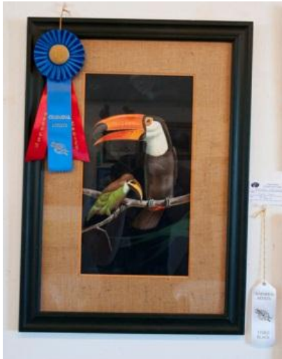
Chuck Caplinger’s Harvest Show People’s Choice Award Winner “Two Can”

The exhibit will run through December 12.