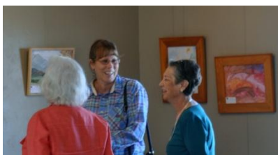
At the "Autumn" show reception at A Roadside Attraction Gallery