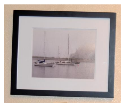
Dome Rock by Judith Nagel currently on display in the "Water, Water" Show

Participate in the Hi-Desert Nature Museum's "Reduce. Reuse, Recycle" exhibition on display January 25 - April 26, 2013. Opening reception will be Friday, January 25th, 5:00 - 7:00 pm. As part of our Earth Day celebration on Saturday, April 20, 2013 the local community is invited to contribute artwork made from recycled or reused materials for display in our "Reduce, Reuse, Recycle" exhibition. Paintings, sculpture, mixed media creations, photographs of recycled products, or any other art -related objects can be loaned to the museum for display in the exhibition. Individual and group projects are welcome and children are particularly encouraged to participate.