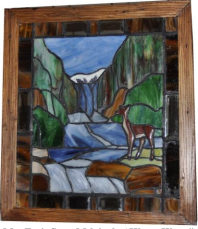
Mae Fox's Snow Melt in the "Water, Water" Show

Call for artists to submit works in an upcoming January exhibit at the Hi-Desert Nature Museum. "All Things With Wings" is the theme... butterflies, dragons, birds, just wings, etc. The exhibit shows from January 25 to April 27, with an opening reception on Saturday, Jan. 25 from 5 to 7pm. Art should be dropped off no later than Friday, January 18, 2013. Each artist is allowed to submit one piece, 2-D and 3-D art accepted. Nothing too expensive or too big. Art will not be sold at the museum. Submission fee is $10. Submitting artists should bring an info card that states the title, dimensions, medium, and artist contact information: this same information should be included on the back bottom of each piece. Art must be ready for hanging/display with hanging hardware.