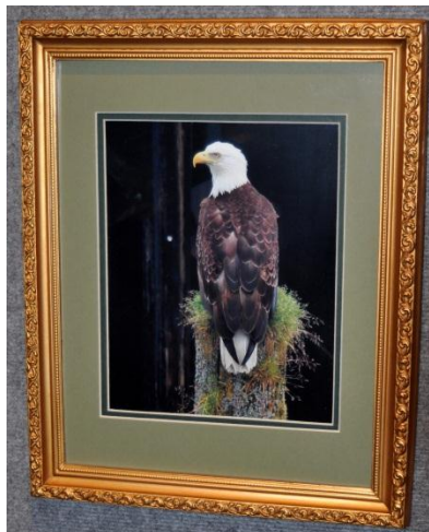
Mies Broome's "Eagle" at the Hi-Desert Nature Museum