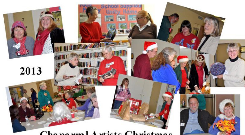
Chaparral Artists Christmas

for all ages. Tickets can be reserved at www.theatre29.org or by calling the Theatre 29 Box Office at 760-361-4151.