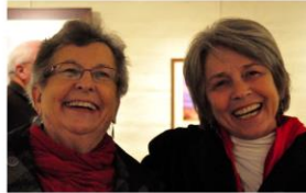
These ladies were having a great time.