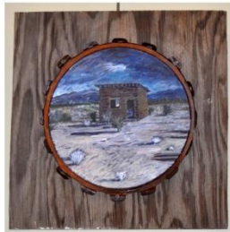
By Sandra Lytch