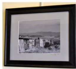
By Tami Roleff