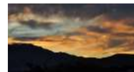
The sunset we photographed