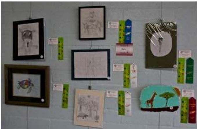
Sixth - Eighth Grade