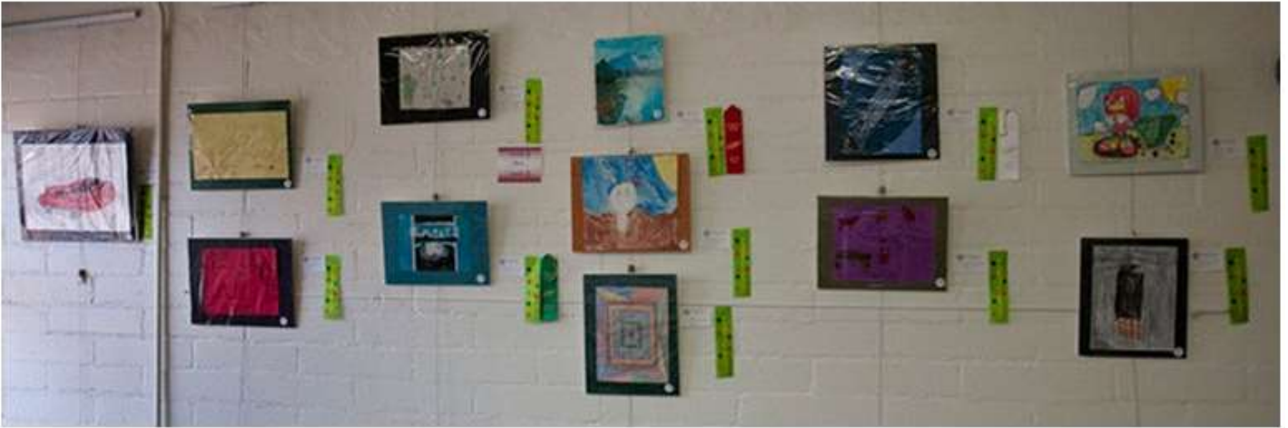
Third - Fifth Grade