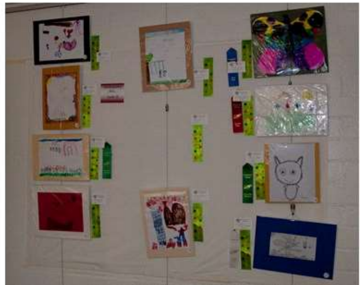
Kindergarten - Second Grade