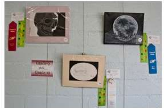
Ninth - Twelfth Grade