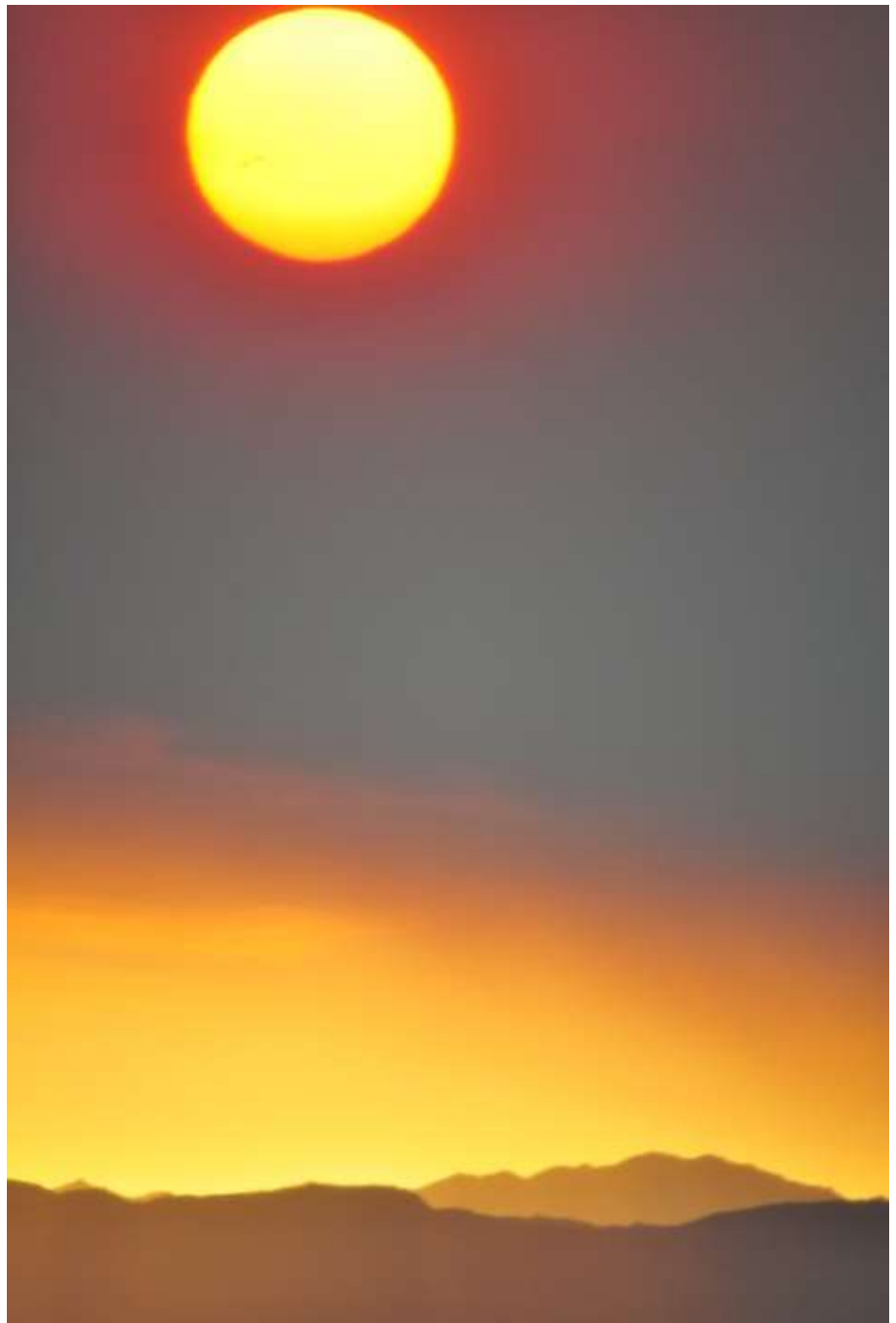
June 19 at 6 a.m. – The Morongo Basin blanketed in smoke from the Big Bear fire