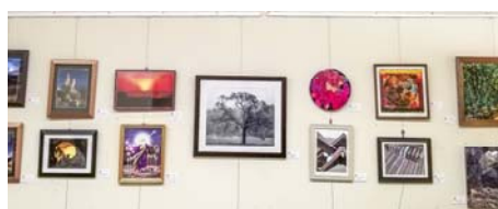
Presbyterian Church—Summer Show

The Morongo Basin Cultural Arts Council provides a wonderful array of display opportunities with their Art in Public Places program. To be eligible to display your art at any of the venues across the Basin, you must be a resident of the Basin and be a member of MBCAC. For more information, please visit the MBCAC website at: mbcac.org/art-in-public-places/