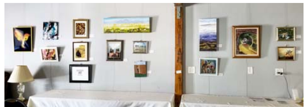
Summer Show at the Center for Healthy Generations July & August—main wall