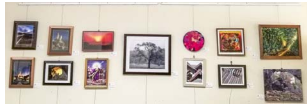
Summer Show at the Presbyterian Church July & August—south wall