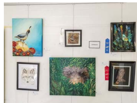
Animals category, Fall Judged Fine Art Show