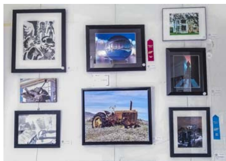
Hand of Man category