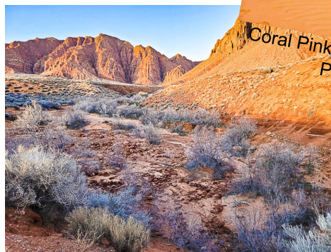
Snow Canyon State Park, Utah