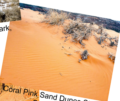
Coral Pink Sand Dunes State Park, Utah