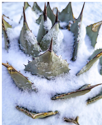
Desert Chill, a snapshot of snow in February

a lunch, or plan on grabbing something at a restaurant, making sure to get your hand stamped so that you can return. The park is open from 8am to 5pm daily. There is so much beauty, life, and energy at this slice of heaven in the desert, so take advantage. Admission is $29.95 for adults (13+), $27.95 for seniors (65+), and $19.95 for children.