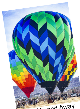
Up Up and Away Hot Air Balloon Festival, Utah

The following photos summarize just some of the places I have been over the last couple months. Because of my travels, the Chaparral Sketch was delayed, resulting in the merging of February and March. Busy but fun!