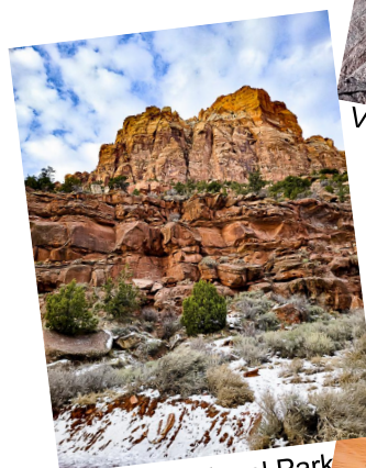
Zion National Park, Utah