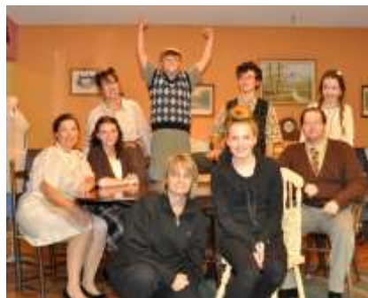
Cast & crew of Brighton Beach Memoirs