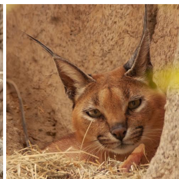
Living Desert snapshots by Raini Armstrong