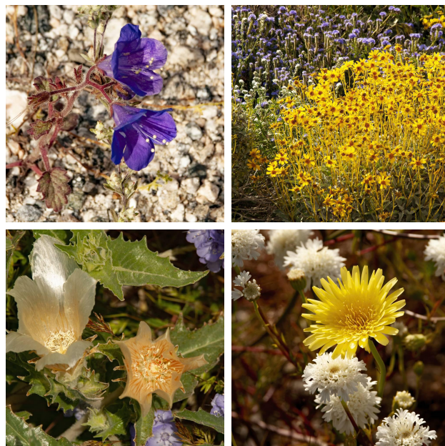
Spring flowers at Whitewater Preserve

The Ramona Pageant, 1:30-5:30pm 1:30 doors open, 3:30 showtime A classic love story of life in early California during the 1850's Tickets available online!