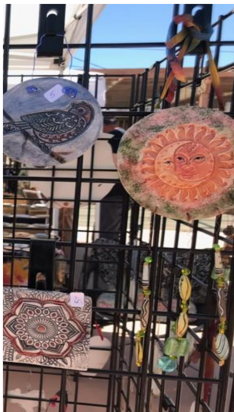
4th Annual 29 Palms Art & Craft Festival