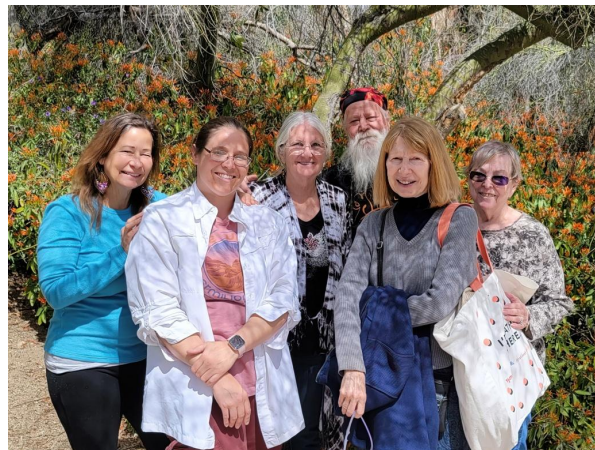
Our group trip to the Living Desert

Our next Board meeting will be on April 10 from 11:30 AM to 12:30 PM at the Center for Healthy Generations, right before the General Meeting!