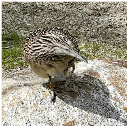
Photo of a quirky roadrunner at the Living Desert Zoo

We hope to plan more and more field trips that might inspire our members to collect imagery for their next art project, provide scenic locations for plein air painting, or a pleasant gathering hub for lunch and conversation. These group trips often inspire our members to plan additional outings to revisit a site or find new ones once they have connected with like-minded art & culture searchers. So, we are always looking for events and locations we can share together. Please share your recommendations and requests for trips you would like to see us plan as a group by contacting us at ChaparralArtists@gmail.com